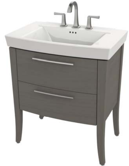
Townsend pedestal top sink 0328.008 shown with 9036.030 vanity and 7760.000 drawer pulls