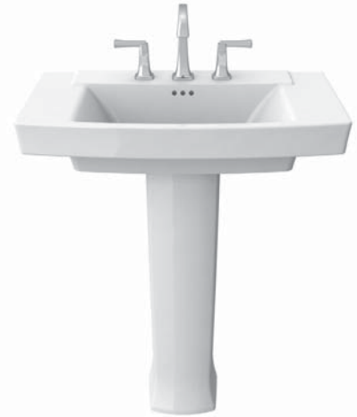
Townsend pedestal combination 0328.800