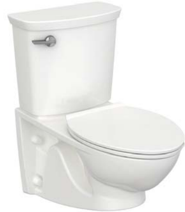
2882107 Combo with Seat 5055A65C