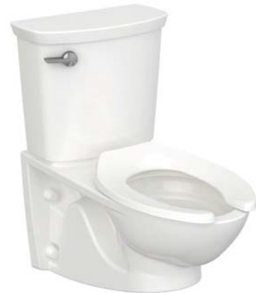
2882107 Combo with Seat 5901100