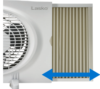
Expander Panels for a Custom Fit