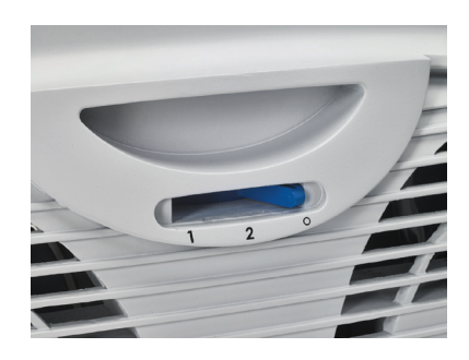
Two Quiet, Energy-Efficient Speeds