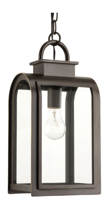
Diameter: 8" Height: 16" Overall Ht. W/Chain: 90-1/2"