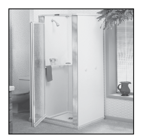
Model 140 shown with optional glass door.