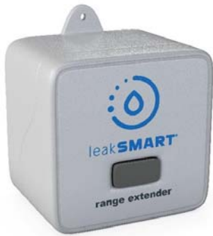
System range extender operates with AC power

Input AC Voltage: 100-240 VAC, 50/60 Hz Maximum Current Drain 0.07A Operating Temperature Range -20°C to 40°C [-4°F to 104°F] AC input IEC Type A, ungrounded, non-polarized