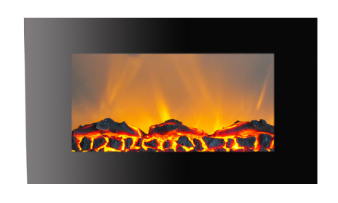
Black w/ Log Display CAM35WMEF-2BLK