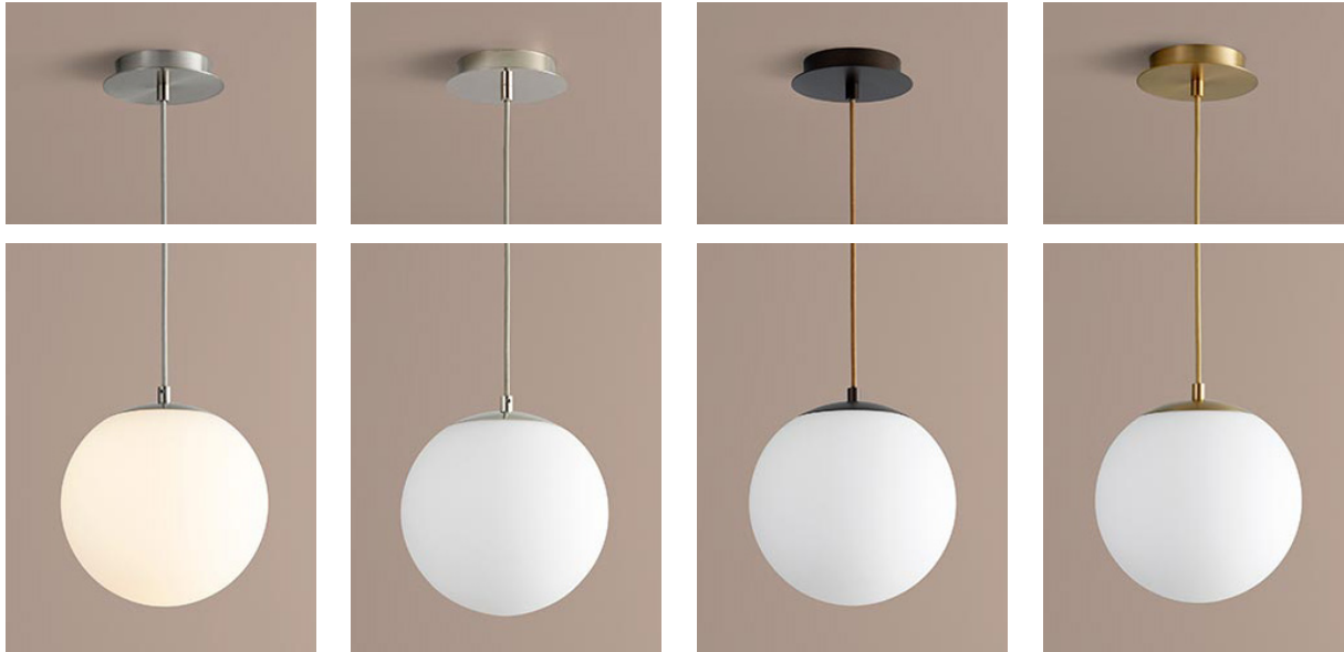
-24 Satin Nickel -20 Polished Nickel -22 Oiled Bronze -40 Aged Brass