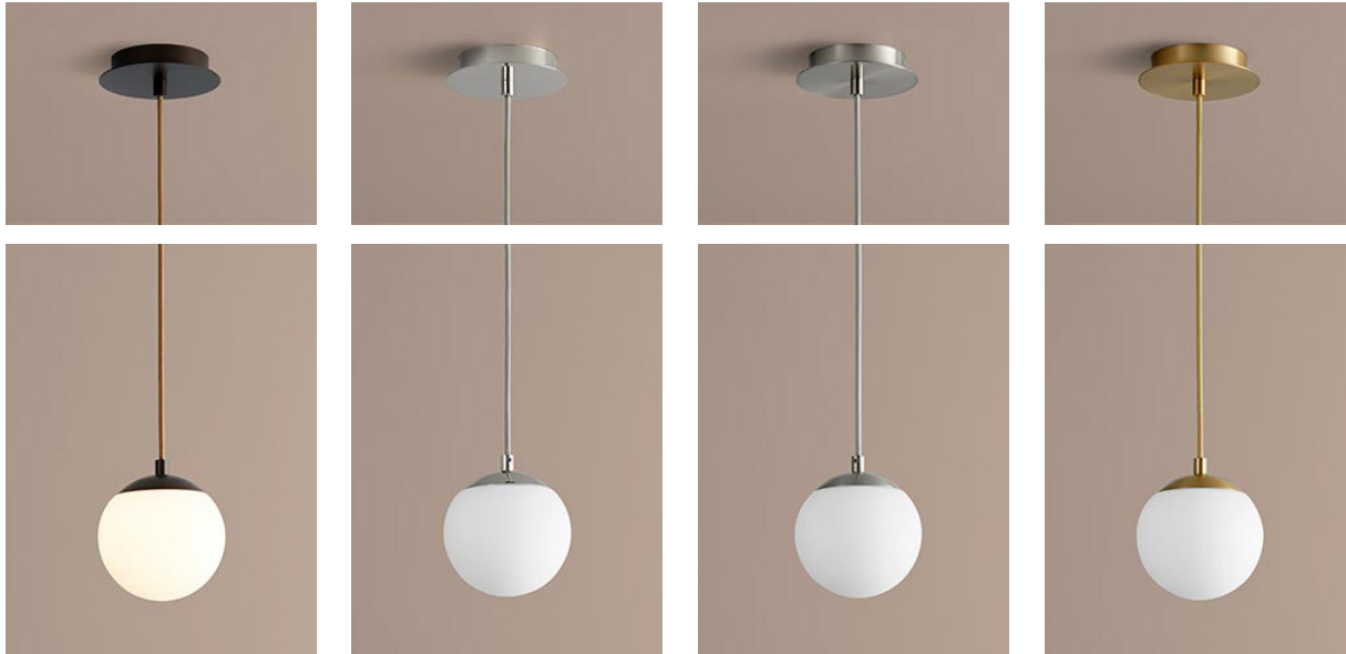
-22 Oiled Bronze -20 Polished Nickel -24 Satin Nickel -40 Aged Brass