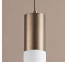
-25 Satin Copper