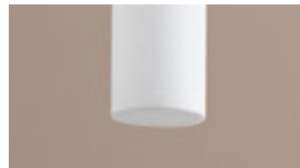
- Matte White Acrylic

LIGHT SOURCE 1 x 5.12W LED, 3000K, CRI 90