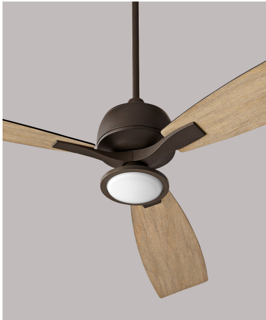
-22 Oiled Bronze with Optional LED Light kit