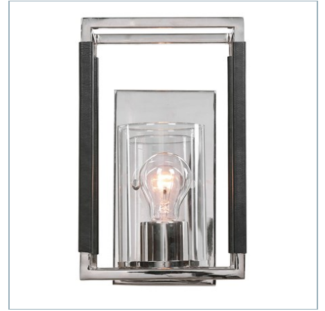
NEWBURGH, 1 LT SCONCE