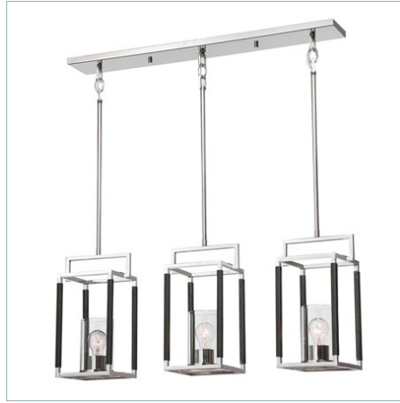
NEWBURGH, 3 LT LINEAR PENDANT