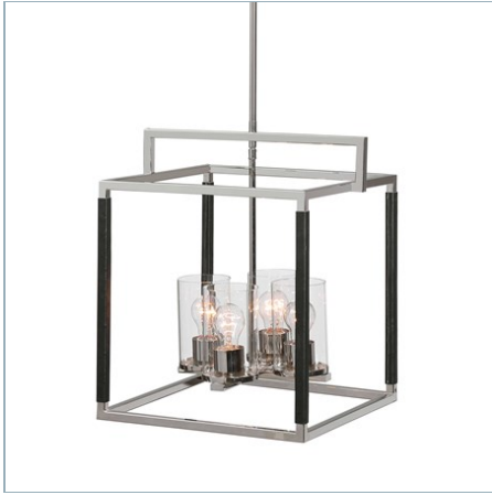
NEWBURGH, 4 LT PENDANT