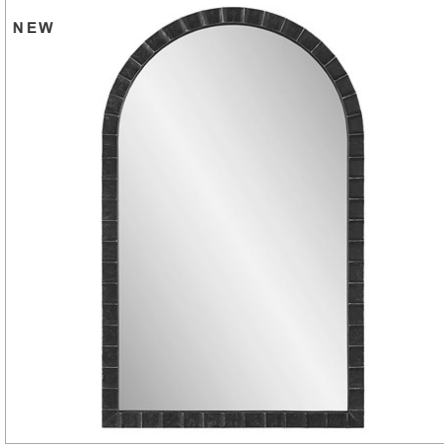
DANDRIDGE ARCH MIRROR