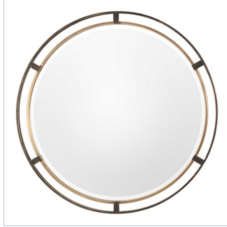
CARRIZO ROUND MIRROR